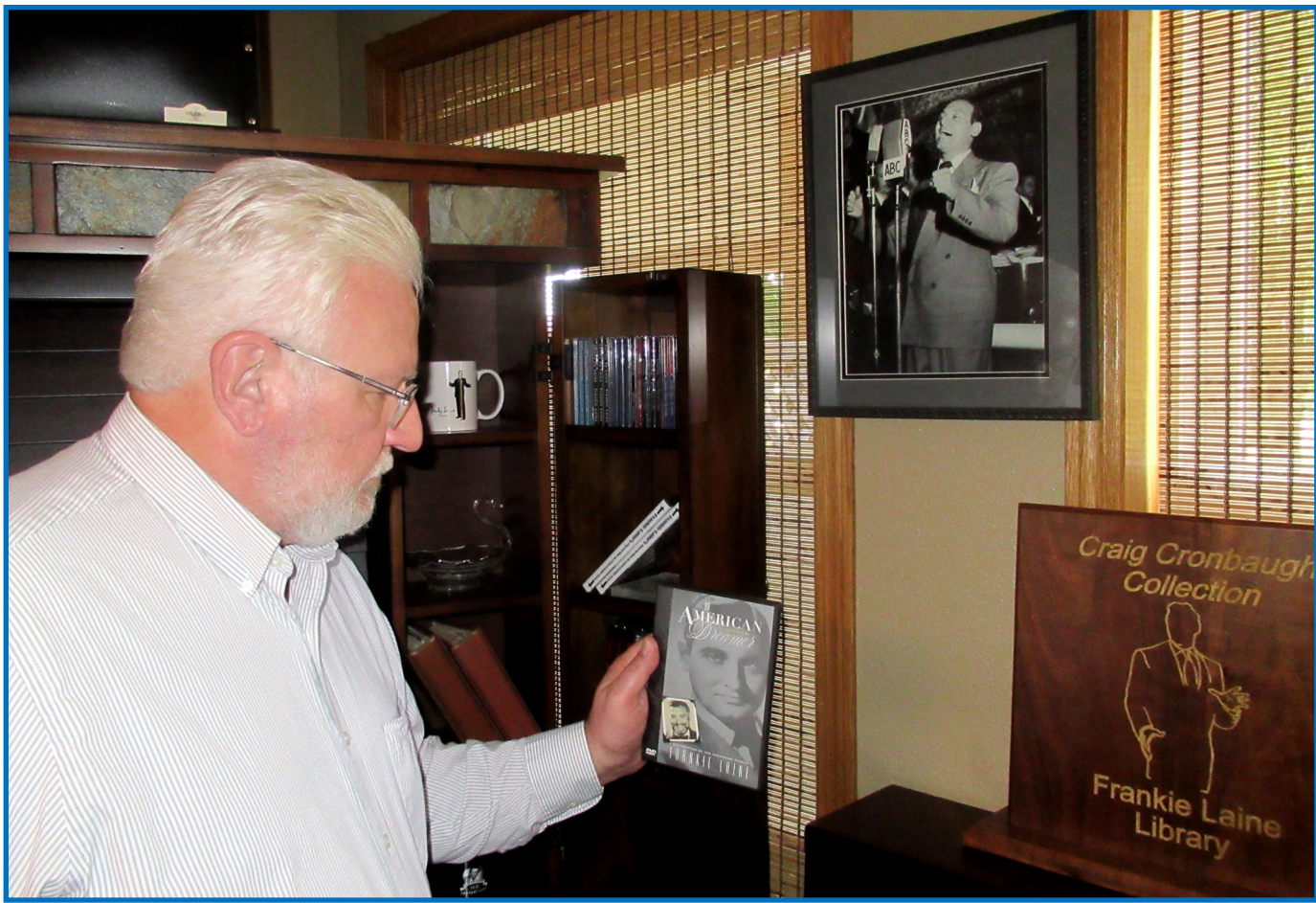
Craig Cronbaugh Frankie Laine Library